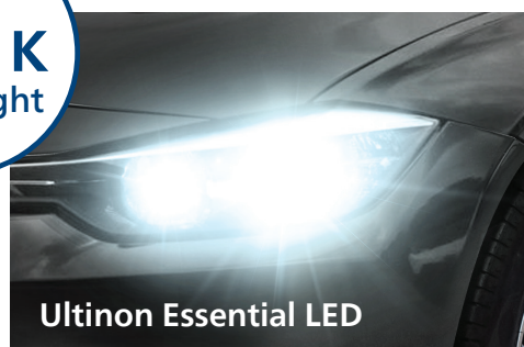
Ultinon Essential LED