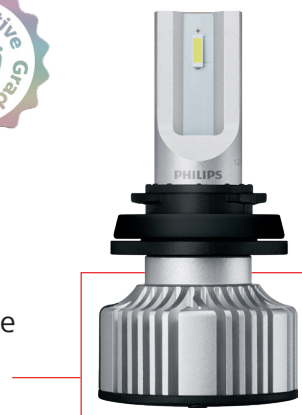
Integrated driver electronics in the bulb.

Important: LED headlights not for sale in the USA; sold in Canada only.